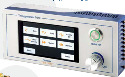
Laboratory type timing generator TG10